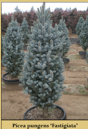
Picea pungens 'Fastigiata'

Are you in need of a one stop nursery supplier? Trying to locate hard to find varieties or sizes? Do you want plants to set yourself off from your competition? Do you need pre-priced custom labels on your plants as they come off the truck? EHR is the answer, we can orchestrate getting your nursery stock orders shipped to your door in the time frame you desire. Let our experts do the leg work for you.