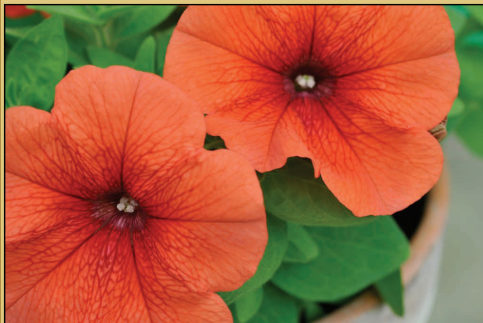
Perfectunia Hot Tamale

Perfect for the Consumer – they are beautiful and perform